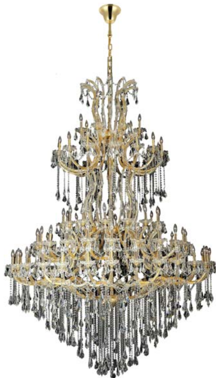
Gold Item No: 2801G96G