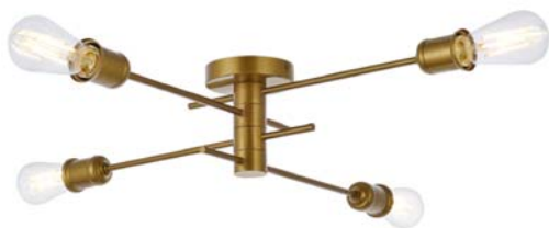
Brass Item No:LD7050F26BR